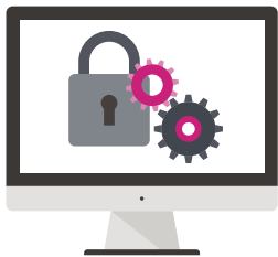
SECURITY & UPDATES