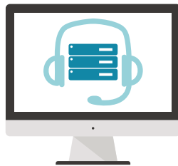
TRAINING & SUPPORT